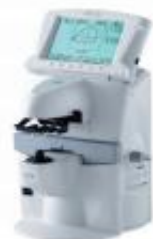
Nidek LM 1000 by Japan

For accurate verification of all types of spectacle lenses including progressive