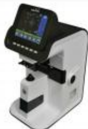
Huvitz HLM 7000 by Korea