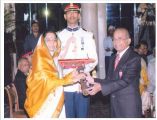
Dr. Tony Fernandez being honored with PADMASHREE, the country's prestigious award by the president of India Smt. Prathiba Patil