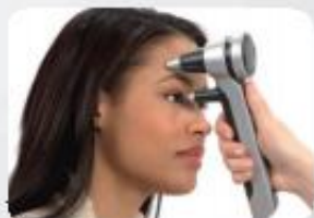
Icare Rebound Tonometers