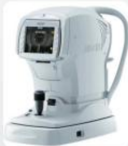
Nidek Non Contact Tonometer

To measure the accurate Intra Ocular Pressure (IOP) at various groups and situations